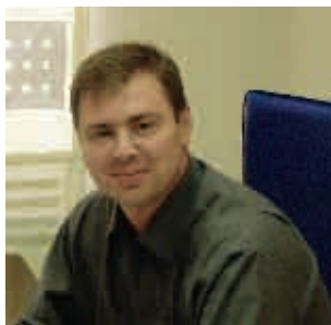
Alexander Belyaev President of Ukrainian Association of Furniture Manufacturers

The mission of UAFM concerns strengthening of positions of Ukraine furniture industry in the domestic market of the country, worldwide integration of the furniture trade into the international economic market, as well as the competitive recovery of Ukraine furniture production in the international business space.